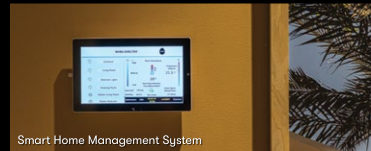
Smart Home Management System