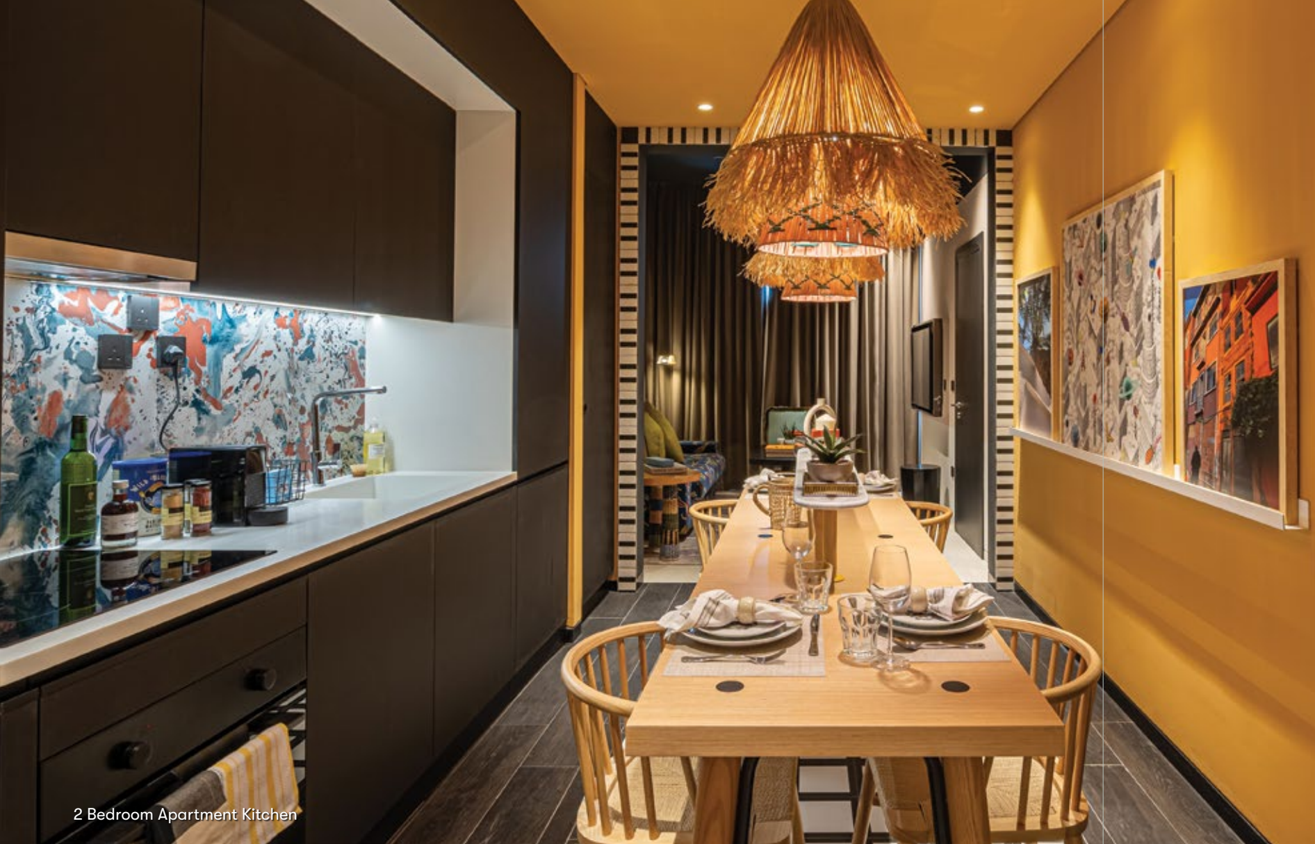
2 Bedroom Apartment Kitchen