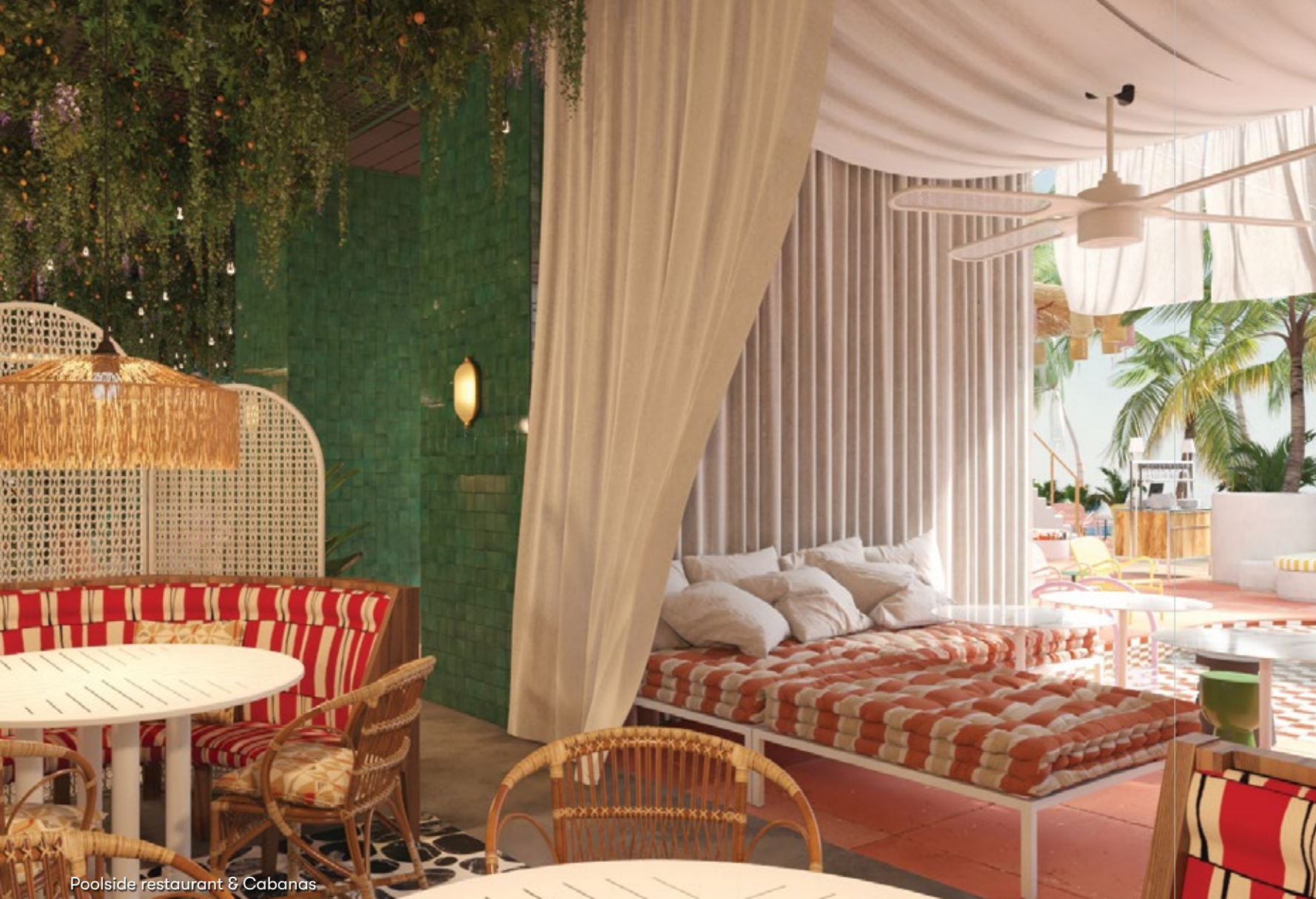
Poolside restaurant & Cabanas