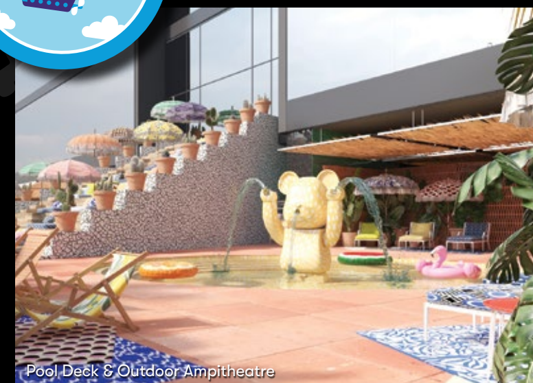
Pool Deck & Outdoor Ampitheatre