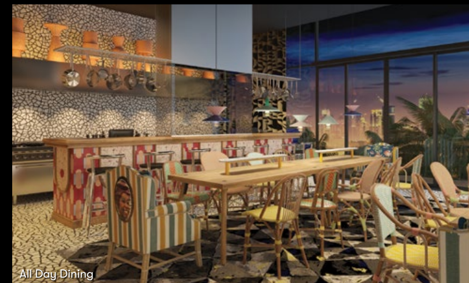
All Day Dining