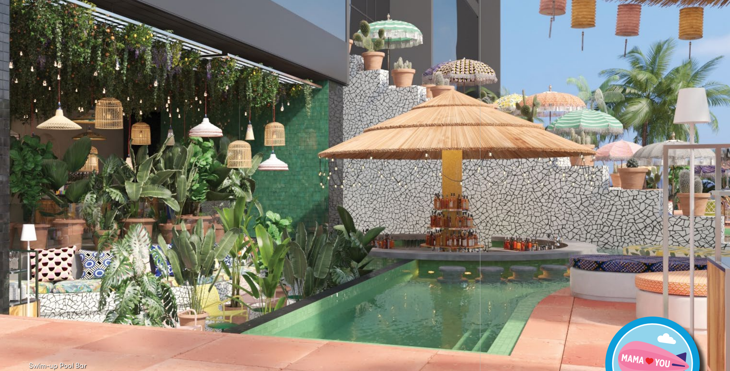
Swim-up Pool Bar