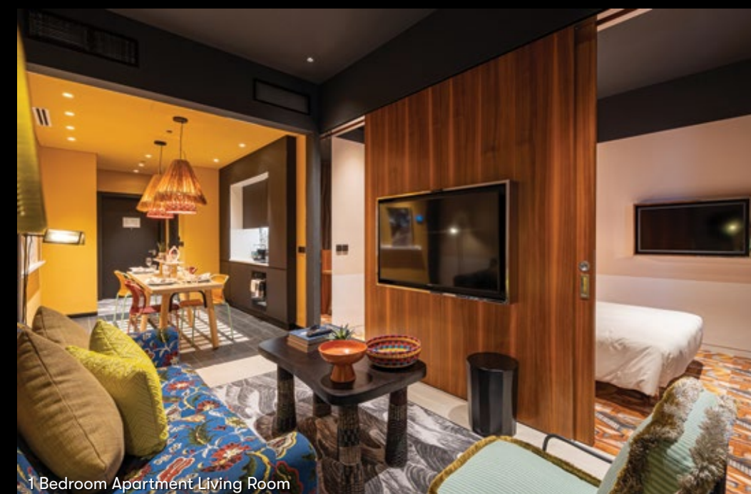
1 Bedroom Apartment Living Room

With exceptional hotel amenities and hospitality services provided by the global lifestyle hotel leader Ennismore to complete the picture, this fusion of world-class, leading hospitality and the ultimate in-home design makes this an unmatched choice in Dubai. Step inside and start living. With personalized free WiFi, a virtual concierge, a top-notch in-room entertainment system with TV and free movies on demand in every apartment... Nothing is too much to imagine for Mama!