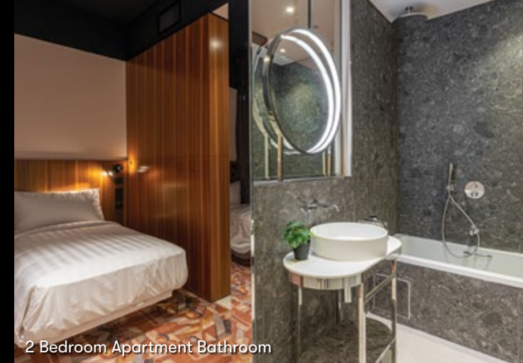
2 Bedroom Apartment Bathroom