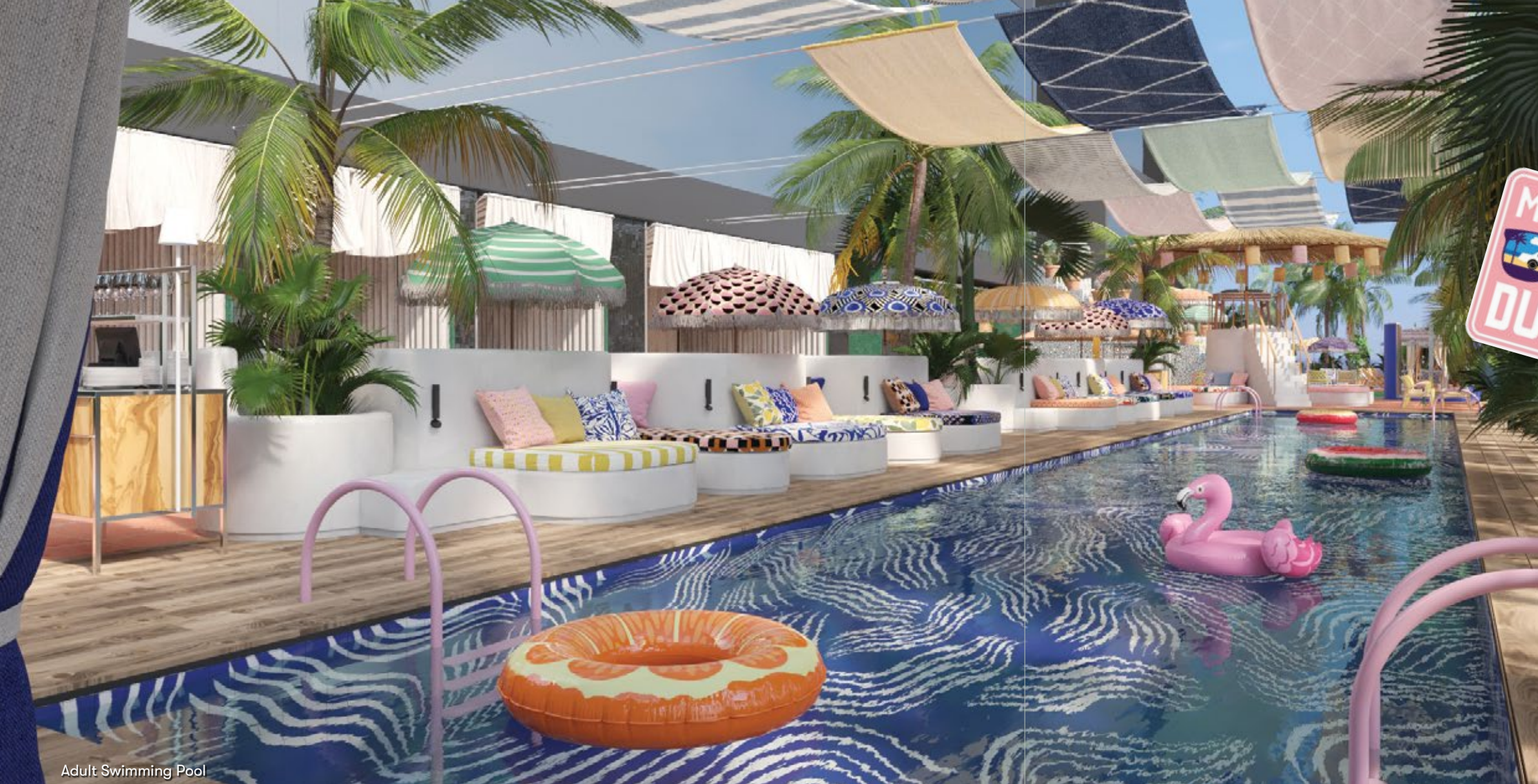
Adult Swimming Pool