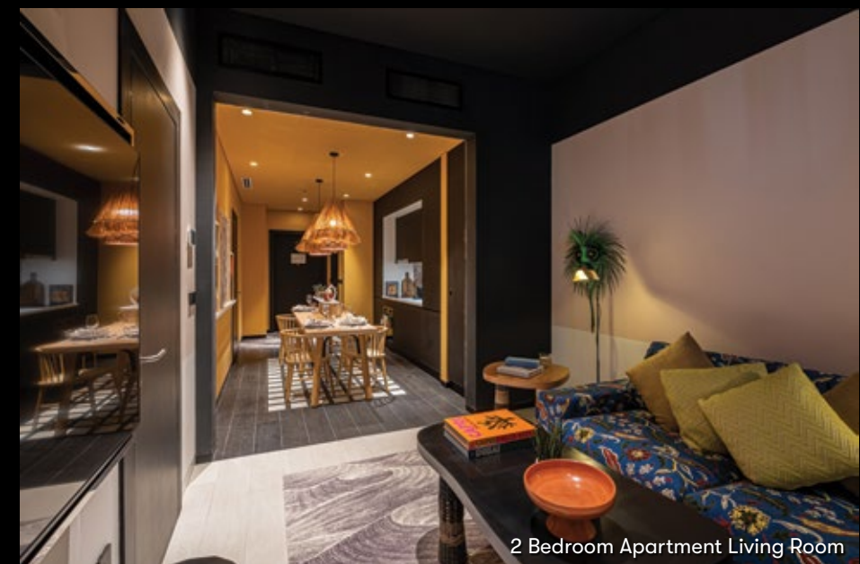
2 Bedroom Apartment Living Room